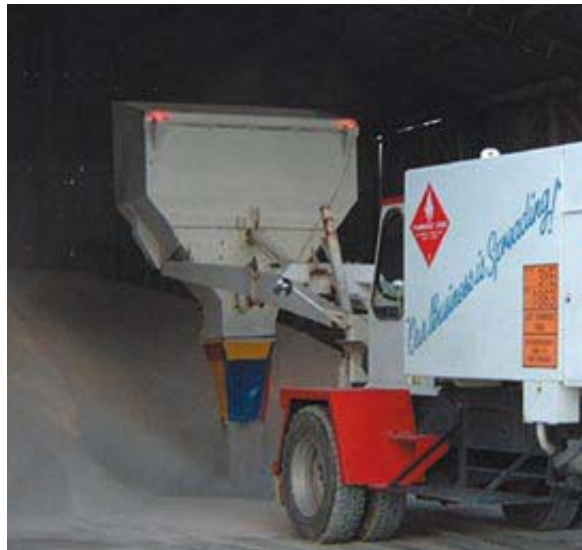
Hopper with free-flowing fertiliser

The procedure for the field test involves two steps: