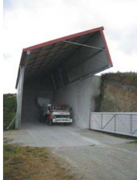
Example of good fertiliser storage facility

Providing a weatherproof storage area for top-dressing fertilisers can therefore reduce the cost of the operation and remove a very real hazard to safe top-dressing operations.