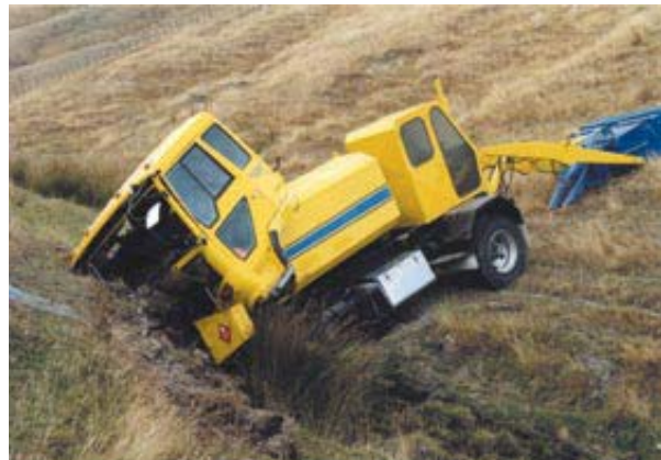
Above and below: Vehicle accidents can and do happen. Always take all practicable steps.

Transport of fertiliser, machinery and fuel for top-dressing operations normally requires the use of heavy transport. Access to storage areas on or near the top-dressing airstrip should be via a graded and, if practicable, gravelled road that is well drained and maintained. Although some tracks and roads are not gravelled and are used only in good weather conditions, they shall nevertheless be