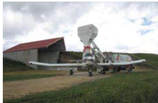
Loading plane using new bin