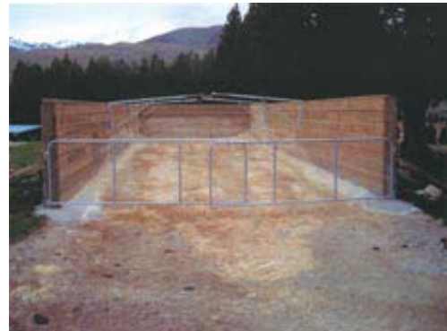
Storage bins and frames for tarpaulin roof