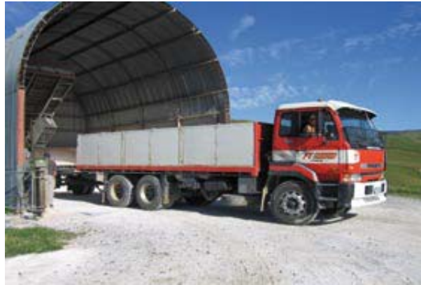
Truck access bin

It is the responsibility of the transport operator not to alter the condition of the fertiliser as it was when uplifted from the manufacturer. Water shall not be added as a dust control measure during transport as this may result in sticky and/or lumpy material.