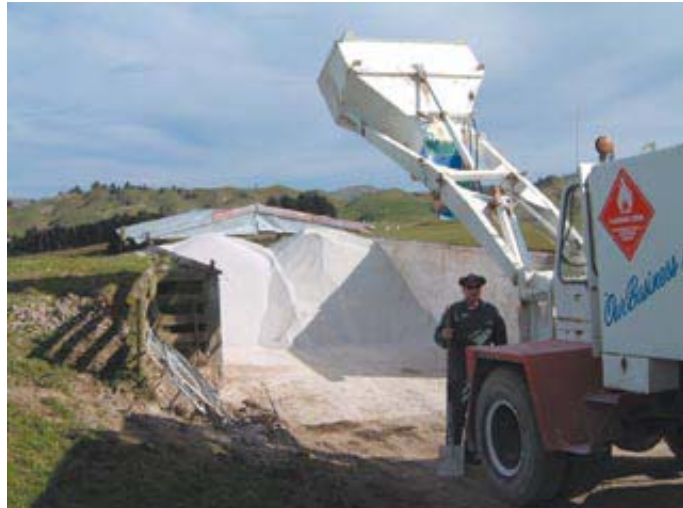
Fertiliser bin with sliding roof in back position for access

The fertiliser storage site may be inspected for suitability on request from owners, farmers, transport operators, top-dressing operators, pilots or loader/drivers. The inspection may be carried out by an appointed health and safety inspector who may refer to this guideline.