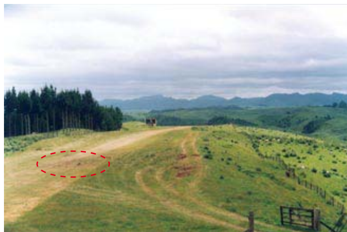
Agricultural airstrip with soft patch

The pilots must report incidents and accidents in accordance with Civil Aviation Authority Rules Part 12 and serious harm under the Health and Safety in Employment Act 1992.