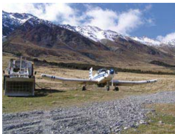
Ground-based refuelling operations.

Employers and self-employed people must also abide by the aviation safety reporting requirements of the Civil Aviation Authority Rules Part 12 and the serious harm reporting requirements of s.25 of the Health and Safety in Employment Act 1992.